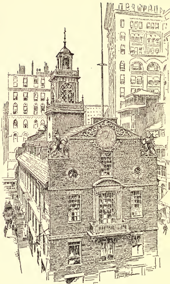
OLD STATE HOUSE, STATE STREET.